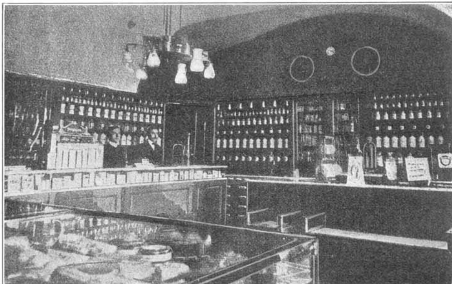
The interior of the remodeled Kapitel-Apotheke zur heiligen Maria, Zagreb (Agram) 1910—had its origin in 1599.

State hospitals and invariably gave importance to pharmacy in these institutions.